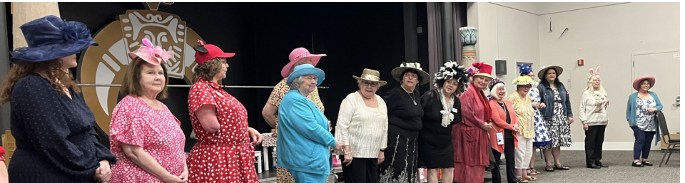
Guests lined up for the hat contest at the Mad Hatter Tea.

We just had our annual fundraiser - the Mad Hatter Tea. Thank you to all who came and supported us this year. We had a good turn-out. The Nosey Nydians came and clowned around a bit. It's always on the Thursday of Spring Break, so mark your calendars. We hope to see you again next year!