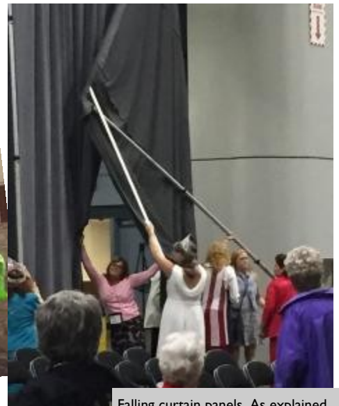
Falling curtain panels. As explained in Pr. Royal's OV message