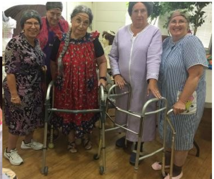
Some “99 year old” Nydia members ready to invite all to our 100th Can you guess who they are?