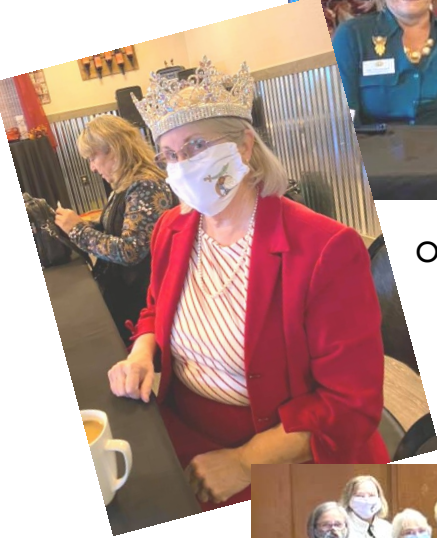
October 28th - Three Sisters Nile Club ↓