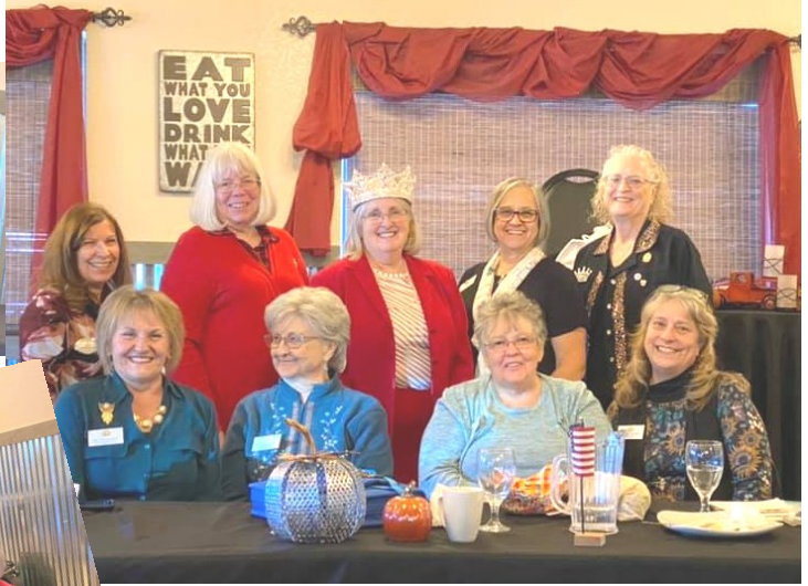
October 27th NEON - NE Oregon Nile Club ↑