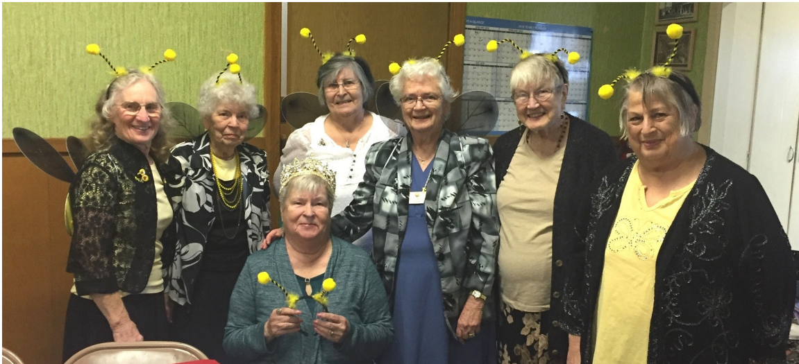
The "Bee Workers" at the Dallas Nile Club OV