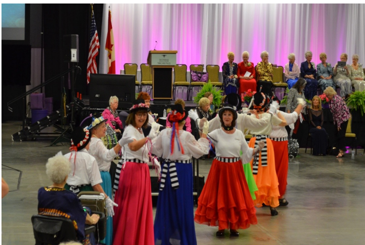
Our Padir Ladies dancing in at Supreme

We have some amazing, talented, strong women in our Masonic family. Let's make sure that we have a proposal in for them, for there is great work to do, and we can move mountains together!