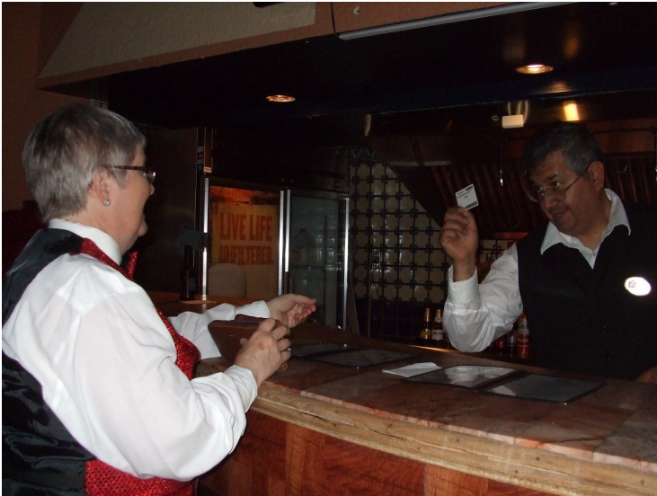
Holly got carded!