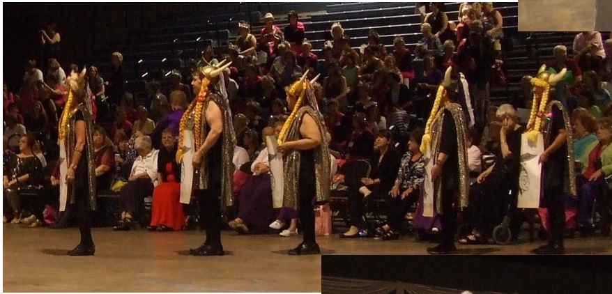
Performances at Supreme