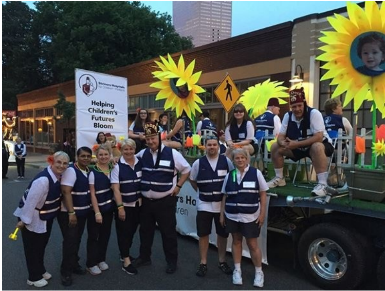
Shriners Hospital float in the Starlight Parade