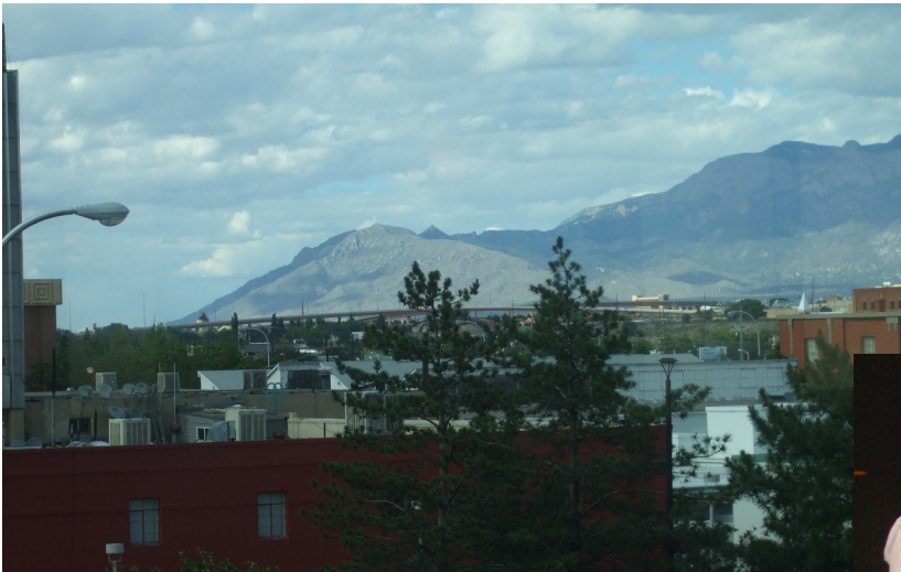
The Sandia Mts