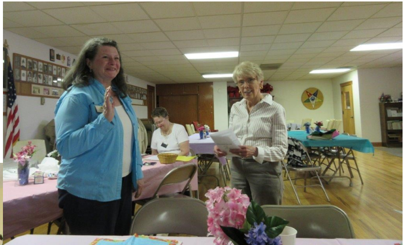
More Pictures from 3 Sisters Nile Club