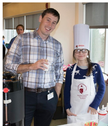
Sewing Committee is responsible for the embroidery on these aprons.

We continue to work on the Transition Quilts, Inpatient Quilts, Pillowcases, bags, shorts and anything else we are requested to do. We look forward to all of our folks returning soon from surgeries and illness. What a great time we have! Please contact me with any questions you may have about the committee and/or how you can help.