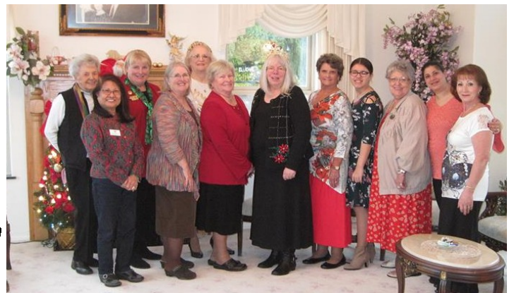
A beautiful afternoon with Eastmont Nile Club