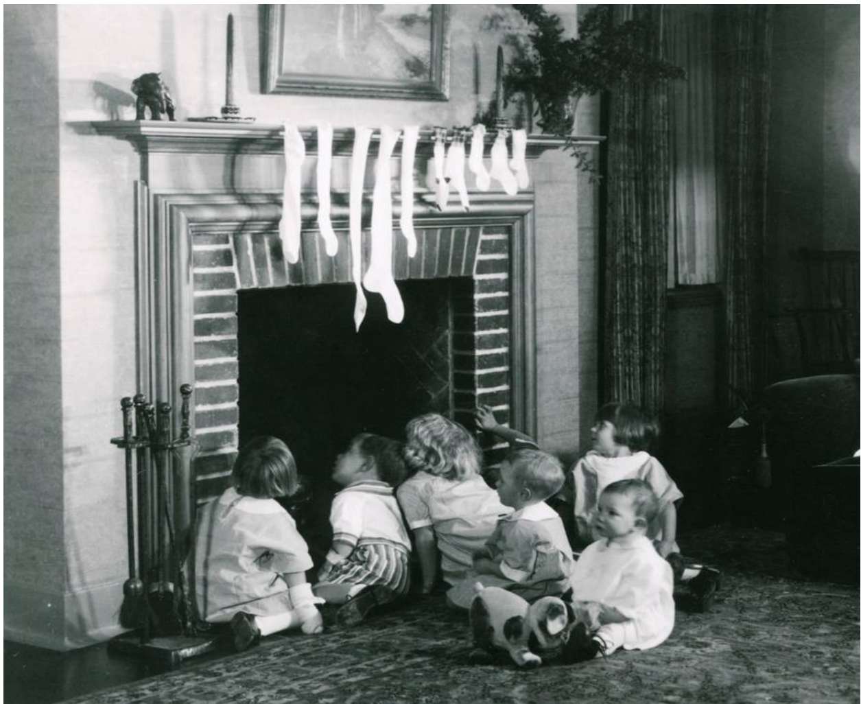
“A few Portland Shriners Hospital patients in the 1930's waiting to catch a peek of Santa in the chimney. This photo was captured in our old building on NE Sandy - and we can't get enough of it! “