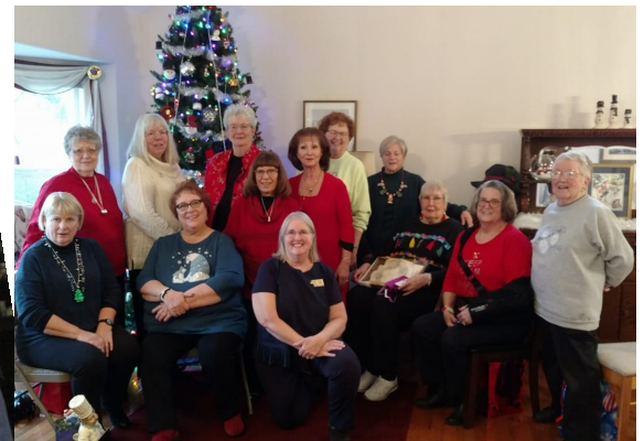
Holiday Party with Nydia Dancers