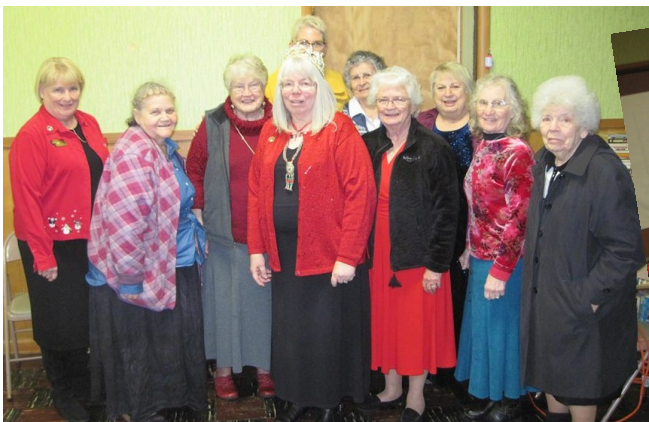
A fun afternoon with the ladies of Dallas Nile Club