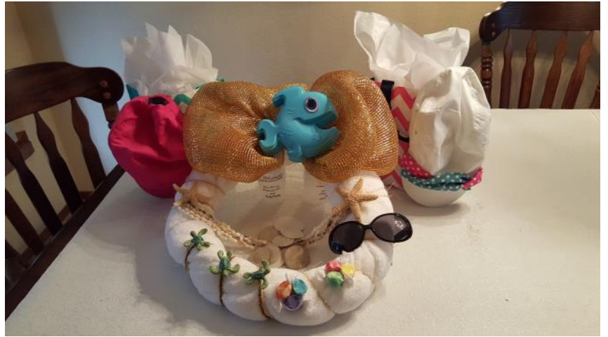
Nite Lites Wreath Auction entry.