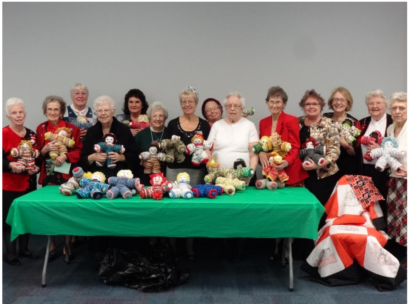
Forest Hills Nile Club OV