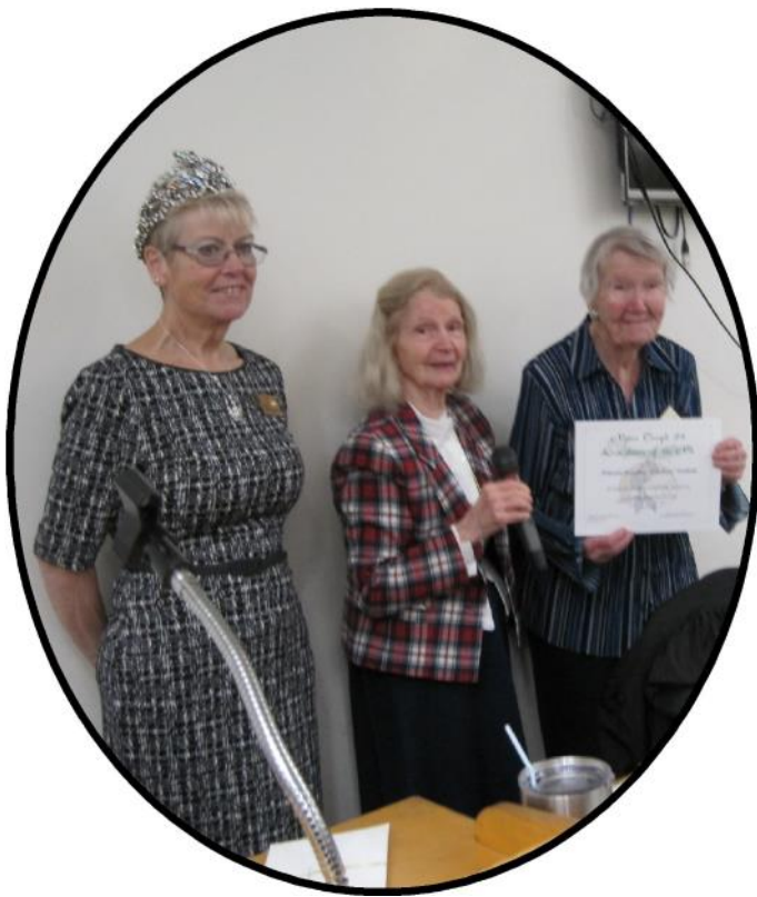
Salem Nile Club & Crackers' 50 year certificate