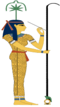
Seshat, Goddess of Scribes