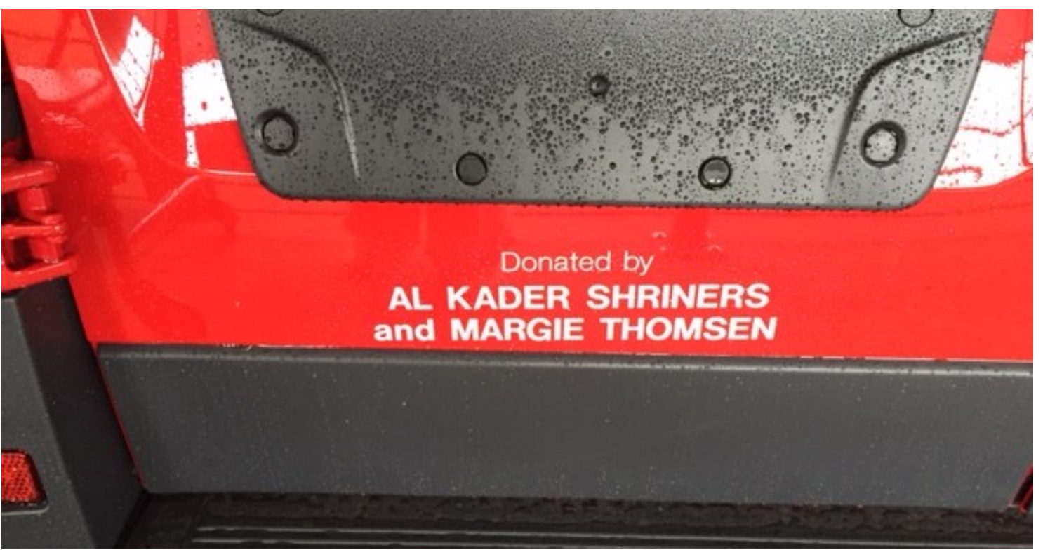
The rear of the new transport vans tells who made them possible.